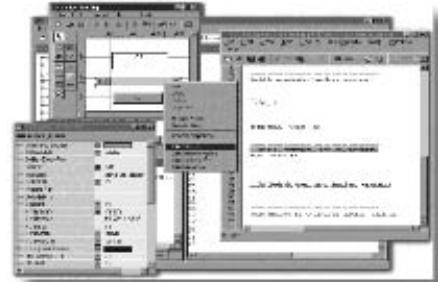
The MATLAB GUI builder tool, GUIDE, lets you easily design your application interface. The customisable design palette of GUIDE offers all the drag-and-drop options you need to create an application interface.

Note: Please ask for your FREE MATLAB for Operations Research information kit and quote lead reference 1932 when contacting us.